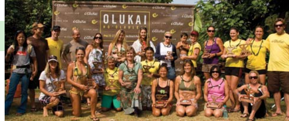
Women's SUP winners