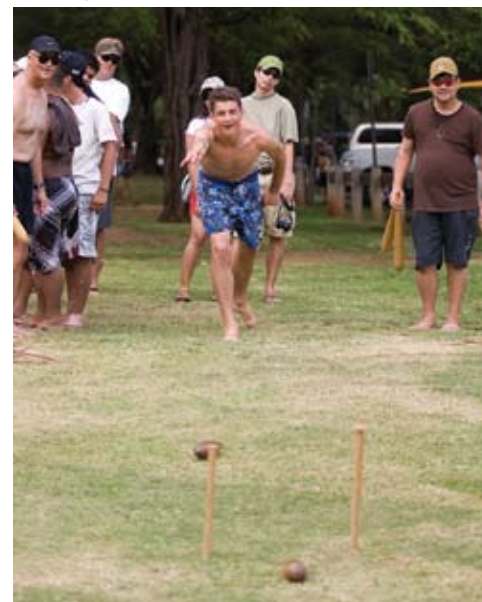
Father and son enjoy the ancient Hawaiian game of Moe Pahe'e (dart sliding)